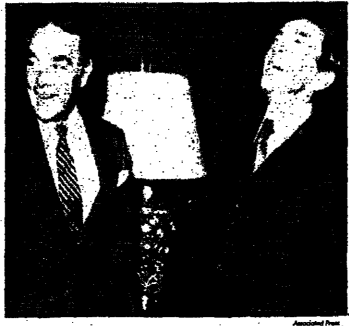
Warren Christopher, former deputy secretary of state, shared a laugh with Secretary of State Alexander Haig Jr. in Washington. He had just come back from his assignment in Algeria.